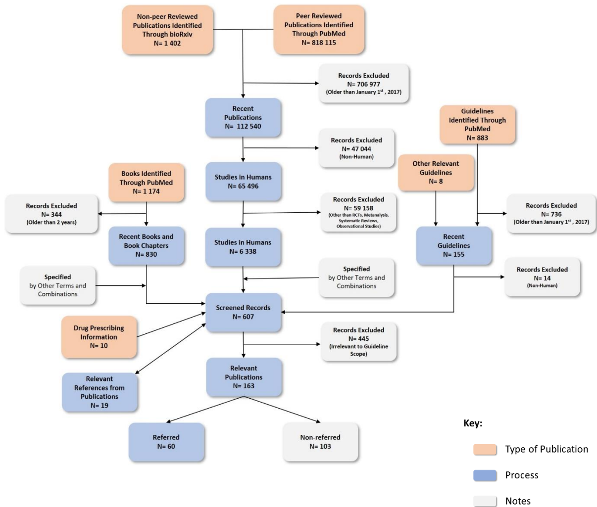
Fig A.1: Literature search results and application of exclusion criteria.